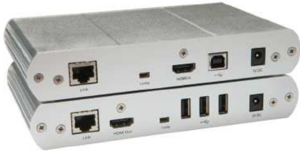
Rear view of LEX (top) and REX (bottom)